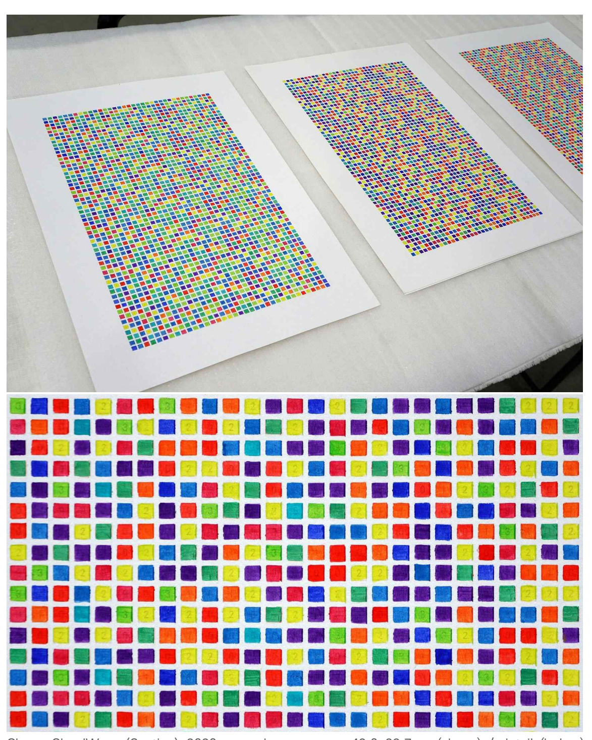
Chang CheolWon, (Sestina) 2020. gouache on paper, 42.0×29.7cm (above) / detail (below)

Using the sestina rule, Chang CheolWon completes an image by hand-filling 2,016 identically sized rectangles with colors. He created 16 paintings so far, and he reveals these can be created infinitely. Chang CheolWon in 21st century Korea experimented on paper with a visual structure the mathematical, linguistic, and sound structure that was experimented with in 12th century France. The result appears like a colorful Morse code with a cheerful sense of rhythm.