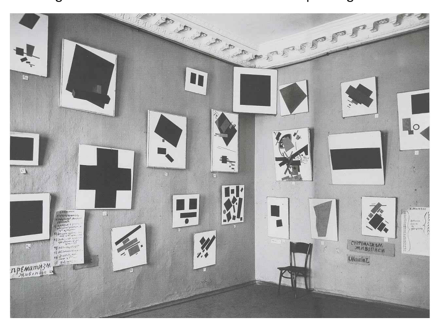
The Last Futurist Exhibition 0.10, 1915, Petrograd, installation view

Afterwards, attempts to move beyond the major premise the painter brought, of 'including three-dimensional objects in flat paintings,' were repeated. Generating images based on specific rules, and not vaguely connecting the giant concepts of science and art, becomes proper art practice. In the case of Chang CheolWon, the artist continues his own artistic practice transcending this against a background of research based on mathematics and physics. The reason his practice is interesting is because he honestly includes his concerns at each stage of the research, thus allowing one to find that his works are 'improving.'